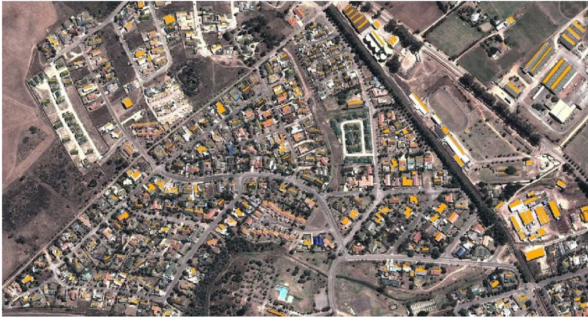
Figure 1: GIS Study results of Hessequa PV study (The yellow roofs were identified in Riversdal as suitable for the installation of a photovoltaic system.)

The Centre is also part of the Stellenbosch Infrastructure Task Team (SITT), which aims to prioritise the short and medium term actions to address the backlog of the Municipality and ensure local economic development and socio-economic growth. The Centre is responsible for the energy aspects of the SITT and it is envisaged the learning of this participation will inform the implementations strategies of other municipalities.