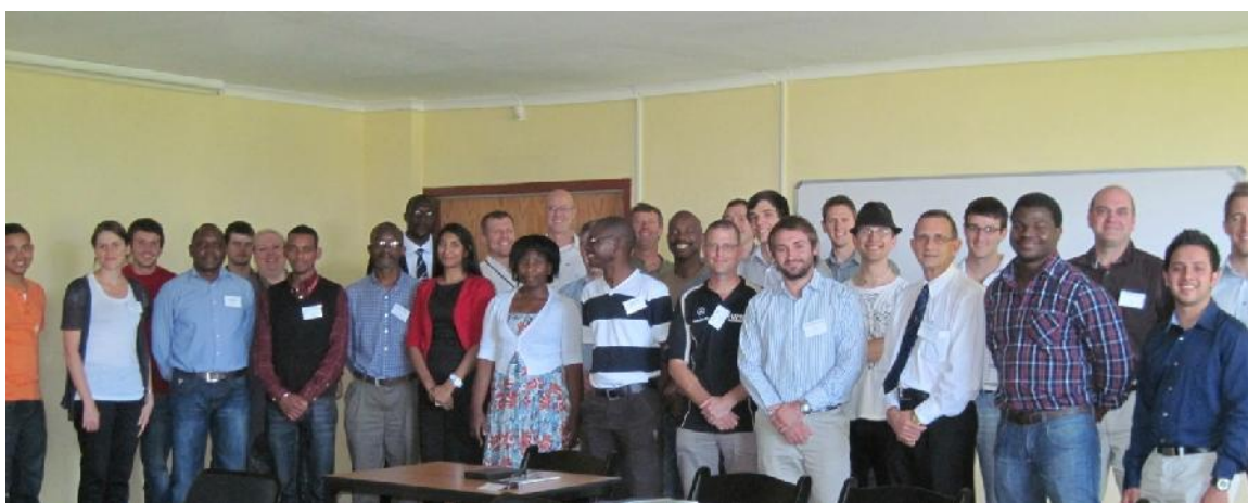
Figure 3: Presenters and supervisors at the 3rd CRSES Post Graduate Student Symposium, Lynedoch, Stellenbosch

The Third Annual CRSES Post Graduate Student Conference was held from 22 to 23 November 2012 at the Lynedoch EcoVillage and was well attended by students and supervisors from all over the country. Twenty post-graduate students from the University of Pretoria, North West University, University of KwaZulu-Natal, Nelson Mandela Metropolitan University, University of Cape Town, Walter Sisulu Univeristy, and Stellenbosch University presented papers at the symposium. The aim of the conference is to create a forum for postgraduate students to share their research. The Centre sponsored those students from outside the Western Cape with a grant for their travel and accommodation cost from the DST/NRF funds. The papers are available on the website: http://www.crses.sun.ac.za/service-conferences.php